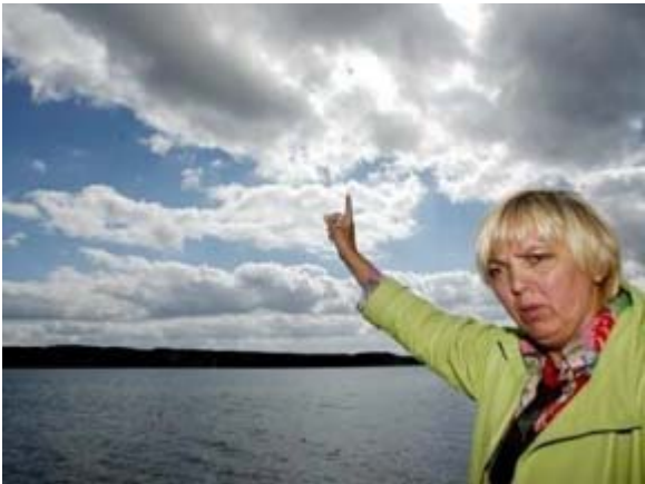
Claudia Roth of the Greens. Is she pointing at the chemtrails in the sky or is she pointing to the ones responsible??