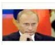
Putin finger on chin