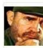
Castro hand on