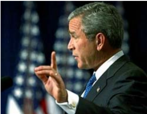
"US senate approves debt plan at a value of 800 billion." (11.2004) Why was it not a photo of the US senate showed, but rather a picture of Bush junior unrelated to this topic?