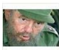
Castro looking up