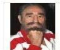
Castro fist on chin2