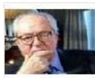
lepen index on face