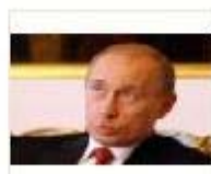
putin looking up