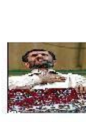
hand on heart