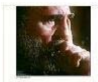
Castro index on face