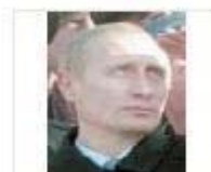
Putin looking up2