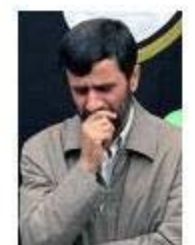
index on face