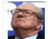
lepen looking up