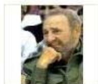
Castro fist on chin