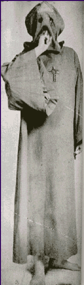
Brother AL in Psilence

Illumination " Cosmic Trigger ." Recalling Crowleymas (October 12) 1974, Brother Wilson hath eloquently stated: